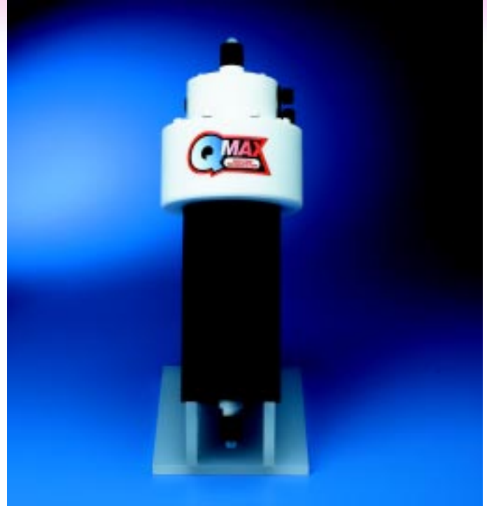
Pictured with optional fluoropolymer coated outer housing.

MTBF: In excess of four years (based on Semi E10-0600 standards)