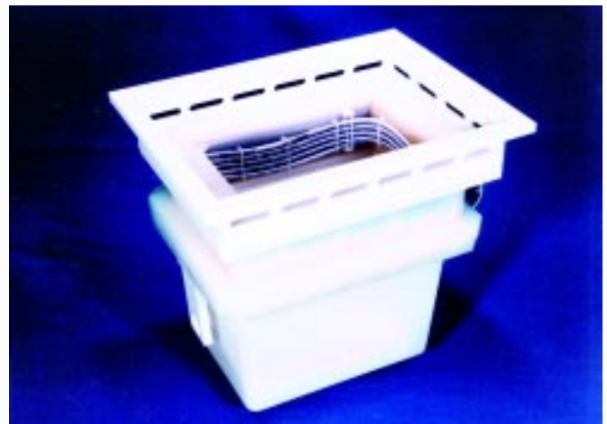
NE tank with condensing head and fume bezel.