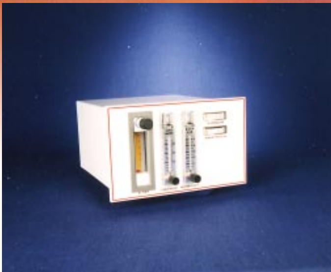
Typical heater purge flow module.