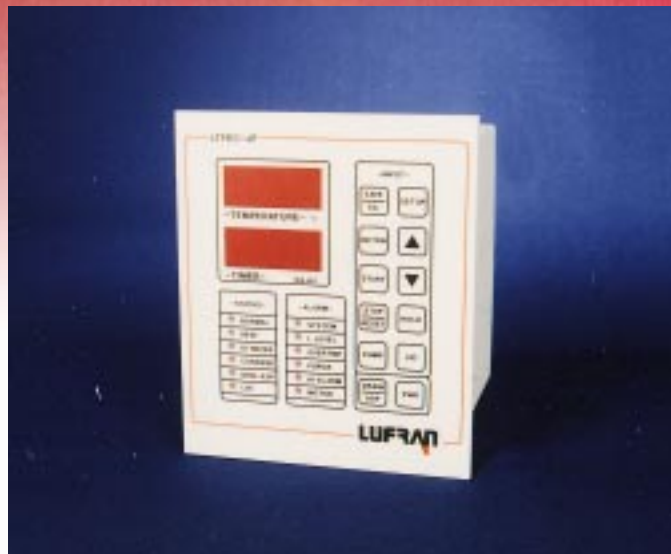
Typical temperature control module (non-CE model).